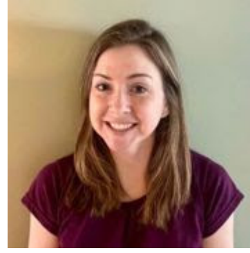
SLI Welcomes Three New Clinical Educators