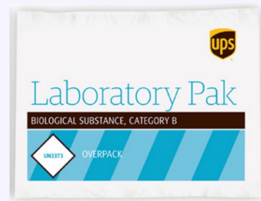
Prepaid Overnight Return Envelope