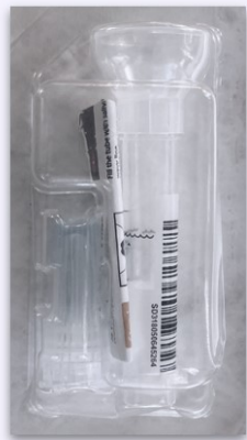
Saliva Collection Device