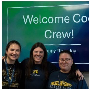
'The Cool Crew' Autism Group Benefits From Eagles Autism Grant