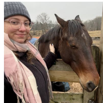
Occupational Therapy Students Saddle Up to Equine-Assisted Therapy Training