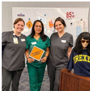
Audiology Students Promote Hearing Health with 'Dangerous Decibels'