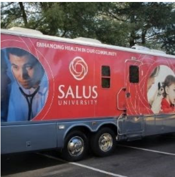
Salus University Gives Kids the Gift of Clear Vision with Big Red Bus