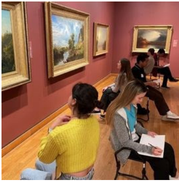
Language is Key for Physician Assistant Students