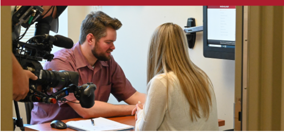
Check out reports about Salus from worldwide media outlets.