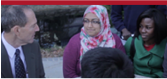
Learn about the state of the University from our president's blog.