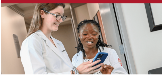
Current students can submit their stories to get a $5 Amazon gift card.