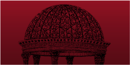
Sharing updates from the Salus University community.