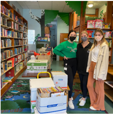
NSSLHA Chapter Welcomes New Executive Board