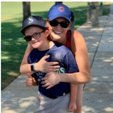
PCO/Salus Plays an Important Role in Boy's Battle Against Cancer